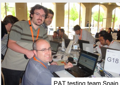
PAT testing team Spain